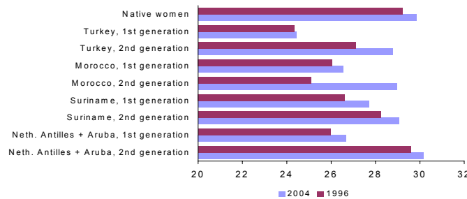
Mean age of mothers at first birth

The fertility of second generation foreigners in the Netherlands clearly different from that of their parents, the first generation. The fertility level of young Turkish women of the second generation is much lower than that of their parents, although it still higher than that of native women. The fertility of the Surinamese second generation is even lower than that of native women.